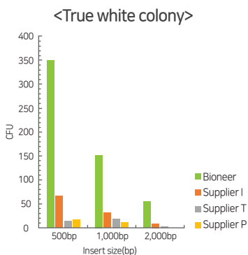
Figure 1. Comparison of clones harboring correct insert after TA Cloning between AccuRapid™ TA Cloning Kit and other supplier's TA cloning kit. The AccuRapid™ TA Cloning system gave a high number of recombinants clone across a broad range of insert sizes (500bp - 2,000bp).